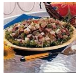
"Potato Salad Never Had It So Good"